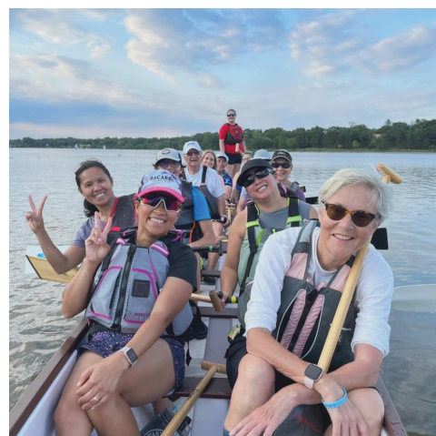
Celebrating another great practice on Lake Phalen