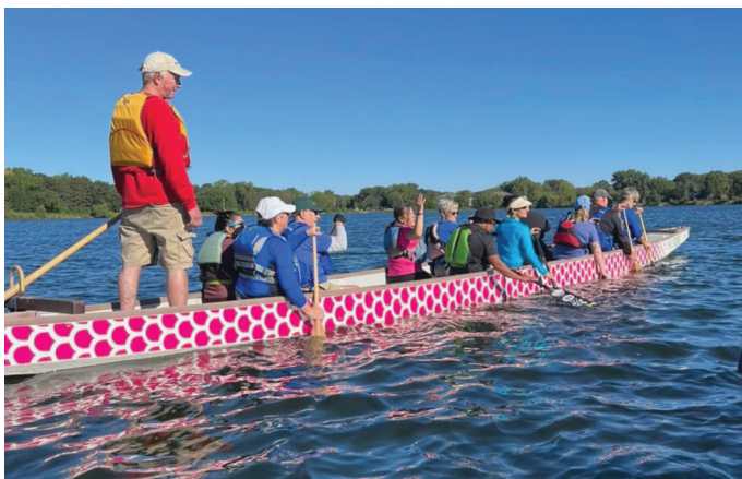
Top right: MNDBC team paddling to the start of an informal race with Off the Edge Community Ed paddlers below. Left, top to bottom: About 90 WaterFest 2022 attendees took the opportunity to try paddling in Aurora and Rose with MNDBC in June.