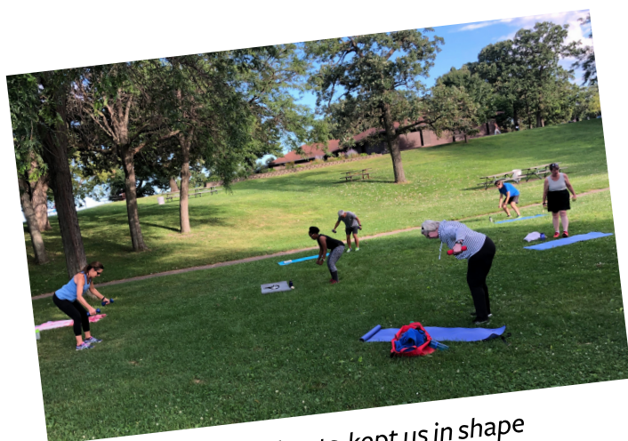
August workouts kept us in shape