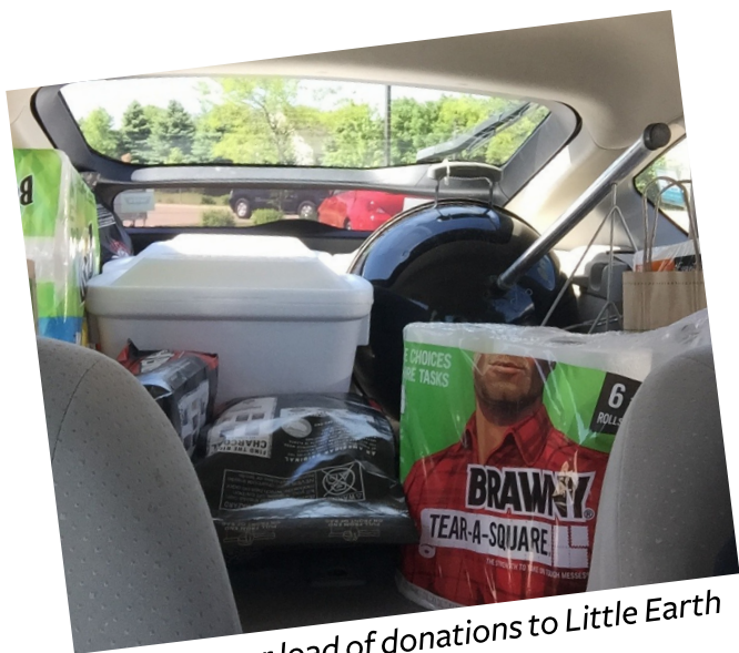
Taking a car load of donations to Little Earth Residents Association