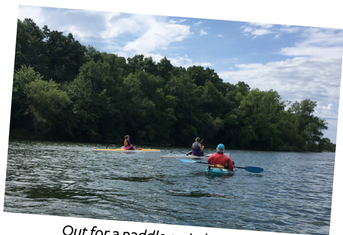
Out for a paddle on Lake Phalen