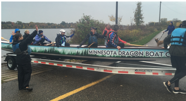
Putting the 2019 season to bed, October 19