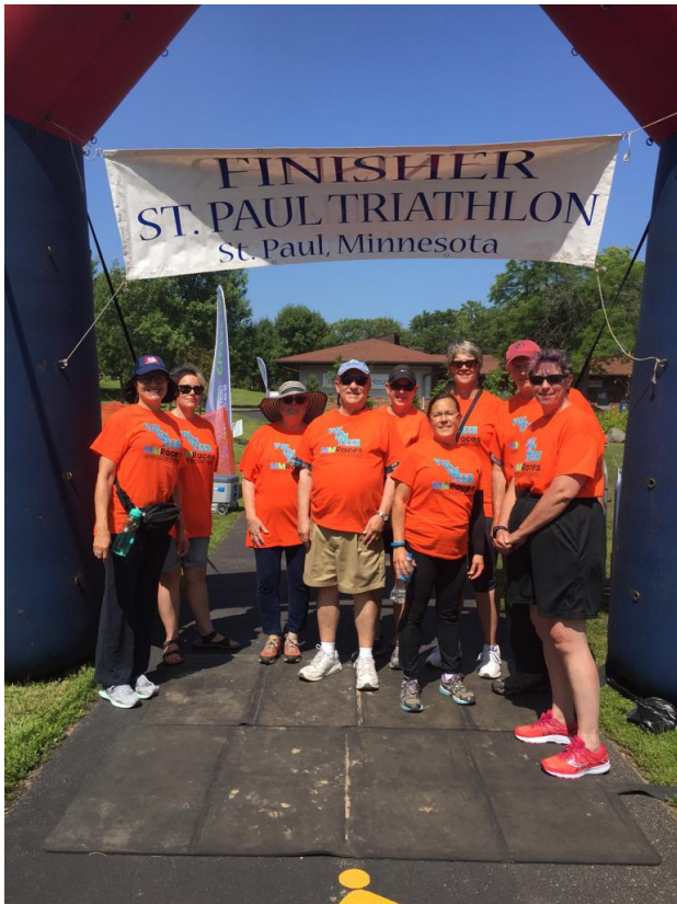
Volunteering with Midwest Multisports, August 17