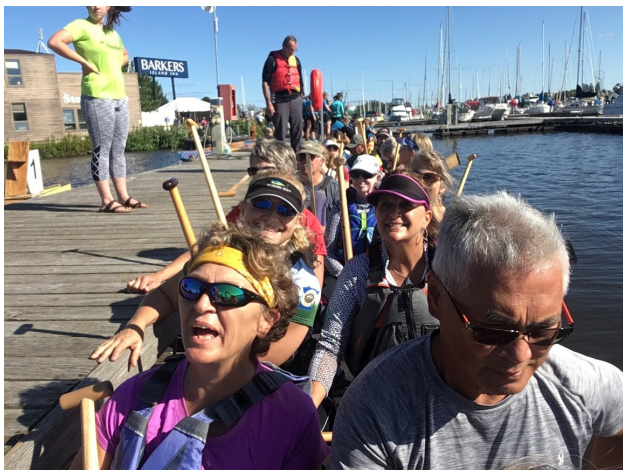
Loading for practice in Superior, August 23