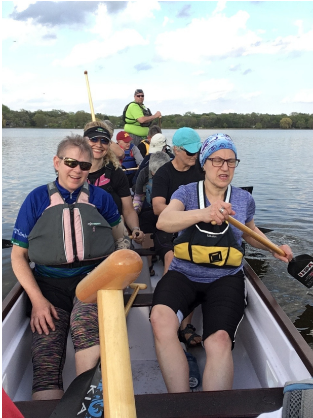
Our first practice, May 14