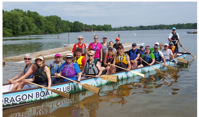
July 4 holiday practice