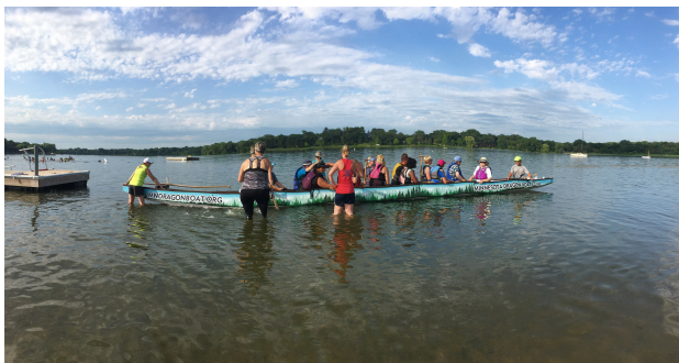
One-on-one training, July 18