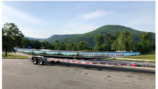
Our boat en route from Florida, April 29