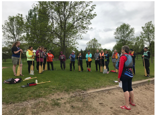
Open paddle, May 23