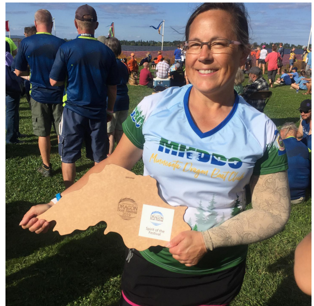
Spirit of the Festival Award, August 24